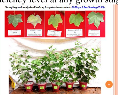
(Department of Biochemistry and Biotechnology, CoA, JAU, Junagadh)

It is informed to scientific community/industrialists that silver and carbon nano-particles based portable nano-biosensor has been invented for detection of potassium directly from the leaf sap of cotton plant with precision. The nano-biosensor works on the basis of ion-selective mechanism to detect potassium ion in the range of 10 to 120 mM. The deficiency of potassium below threshold line of 40 mM from sap with the sensor display indicating the voltage output below (-ve) 15 mV will be signaled. The onetime cost of the invented nano-biosensor is about Rs. 2500-3000 and it works well to detect potassium deficiency level at any growth stage of cotton crop.